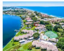
4234 Gulf of Mexico Dr | A1 $665,000.00