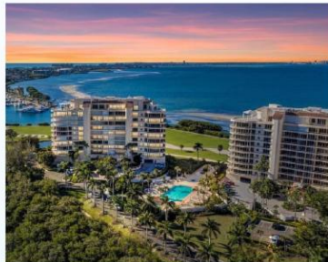
3010 Grand Bay Blvd | 411 $1,590,000.00