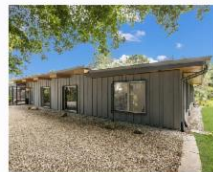
3655 Egerton Circle $555,000.00