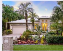
2524 Pleasant Place $2,300,000.00