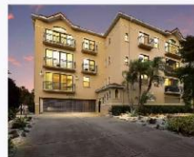
205 Golden Gate Pt | 302 $825,000.00