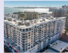
111 S Pineapple Ave | 1212 PH6 $1,825,000.00