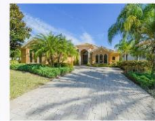
7019 Vilamoura Place $620,000.00