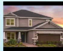
8267 Shooting Star Road $435,788.00