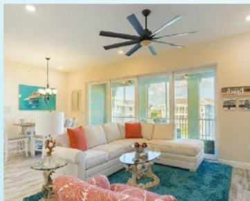
388 Aruba Crl | 401 $850,000.00