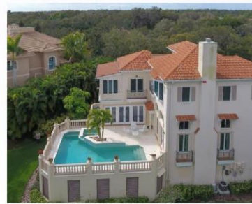
168 Coastal Hammock Court $1,600,000.00