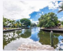
512 Treasure Boat Way $1,390,000.00