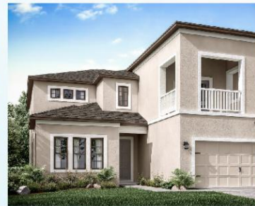
8273 Shooting Star Road $688,070.00