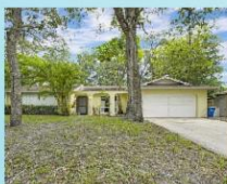
5535 Duncanwood Place $360,000.00