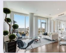
1301 Main St | 502 $2,047,000.00