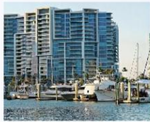
1155 N Gulfstream Ave | 603 $1,850,000.00