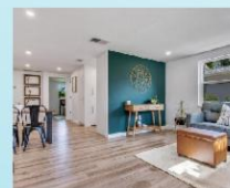
4526 S Lockwood Ridge Road $292,500.00