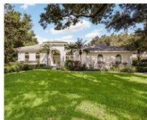
2950 Dick Wilson Drive $740,000.00