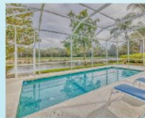
553 Carmona Place $515,000.00