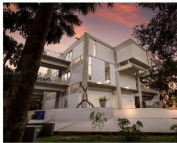
1002 Tara Vista Drive $1,825,000.00