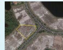
8406 Broadstone Court $398,000.00