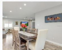
4234 Gulf of Mexico Dr | Q1 $525,000.00