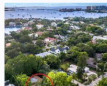
1630 S Orange Avenue $875,000.00