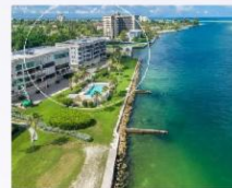
4712 Ocean Blvd | W5 $815,000.00