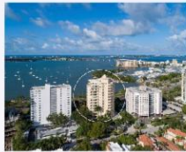
500 S Palm Ave | 102 $2,725,000.00