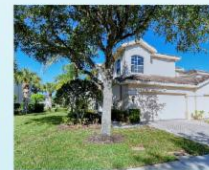
7120 Prosperity Crl | 1208 $400,000.00