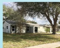
2884 Indianwood Drive $299,000.00