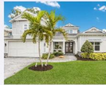
1924 Hibiscus Street $2,400,000.00