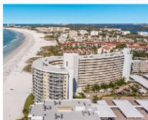
6300 Midnight Pass Rd | 1105 $1,030,000.00