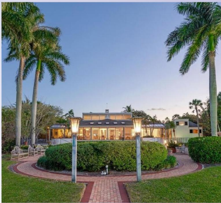
539 Norsota Way $7,000,000.00