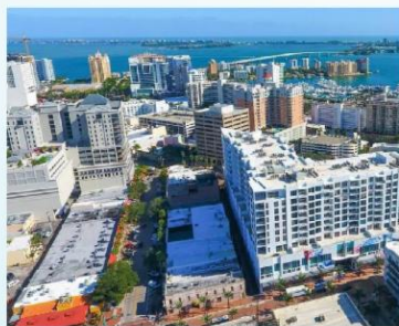
111 S Pineapple Ave | 720 $1,200,000.00