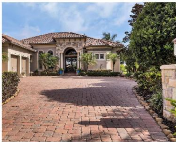
16026 Topsail Terrace $2,300,000.00