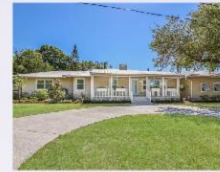
1661 S Jefferson Ave $1,044,500.00