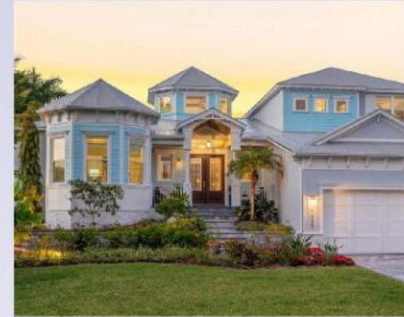
1385 Harbor Drive $3,150,000.00