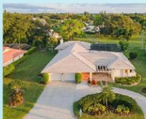
149 Harbor House Drive $607,500.00