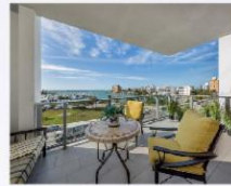
1155 N Gulfstream Ave | 406 $1,375,000.00