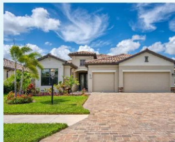
18028 Polo Trail $701,000.00