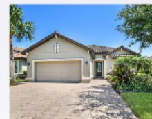
2408 Vaccaro Drive $810,000.00