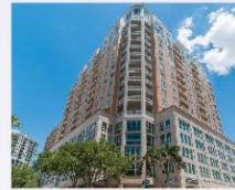
1350 Main St | 1406 $1,200,000.00