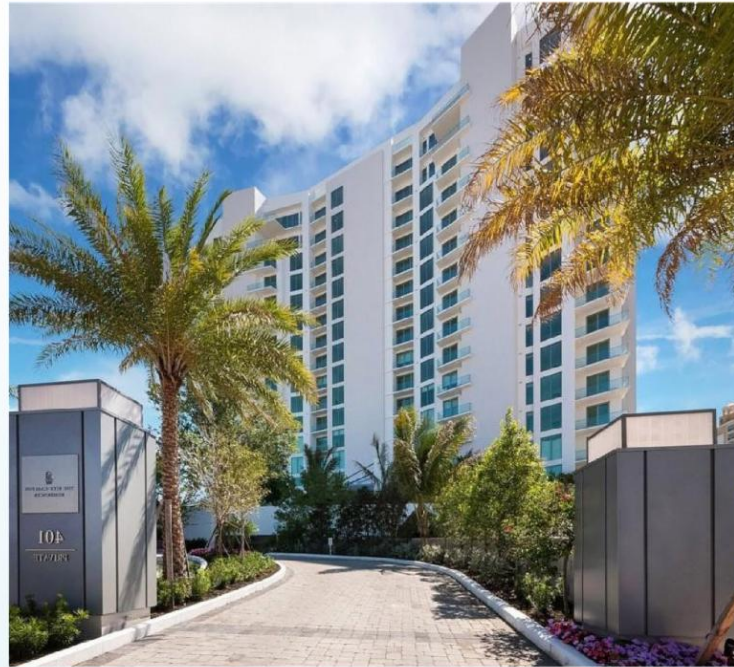
401 Quay Commons | 1603 $6,100,000.00